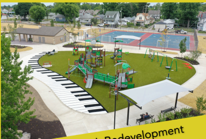
Packard Park Redevelopment