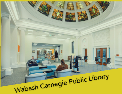
Wabash Carnegie Public Library