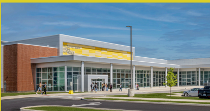
Homestead High School Expansion & Renovation